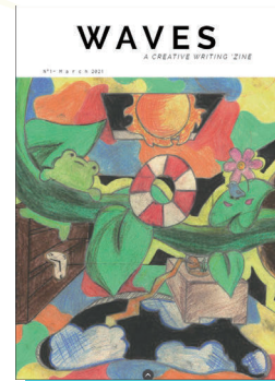
Cover of the debut copy of the online magazine